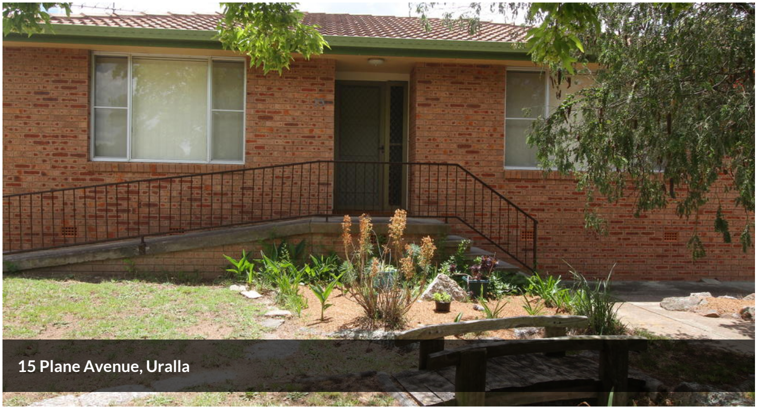
15 Plane Avenue, Uralla