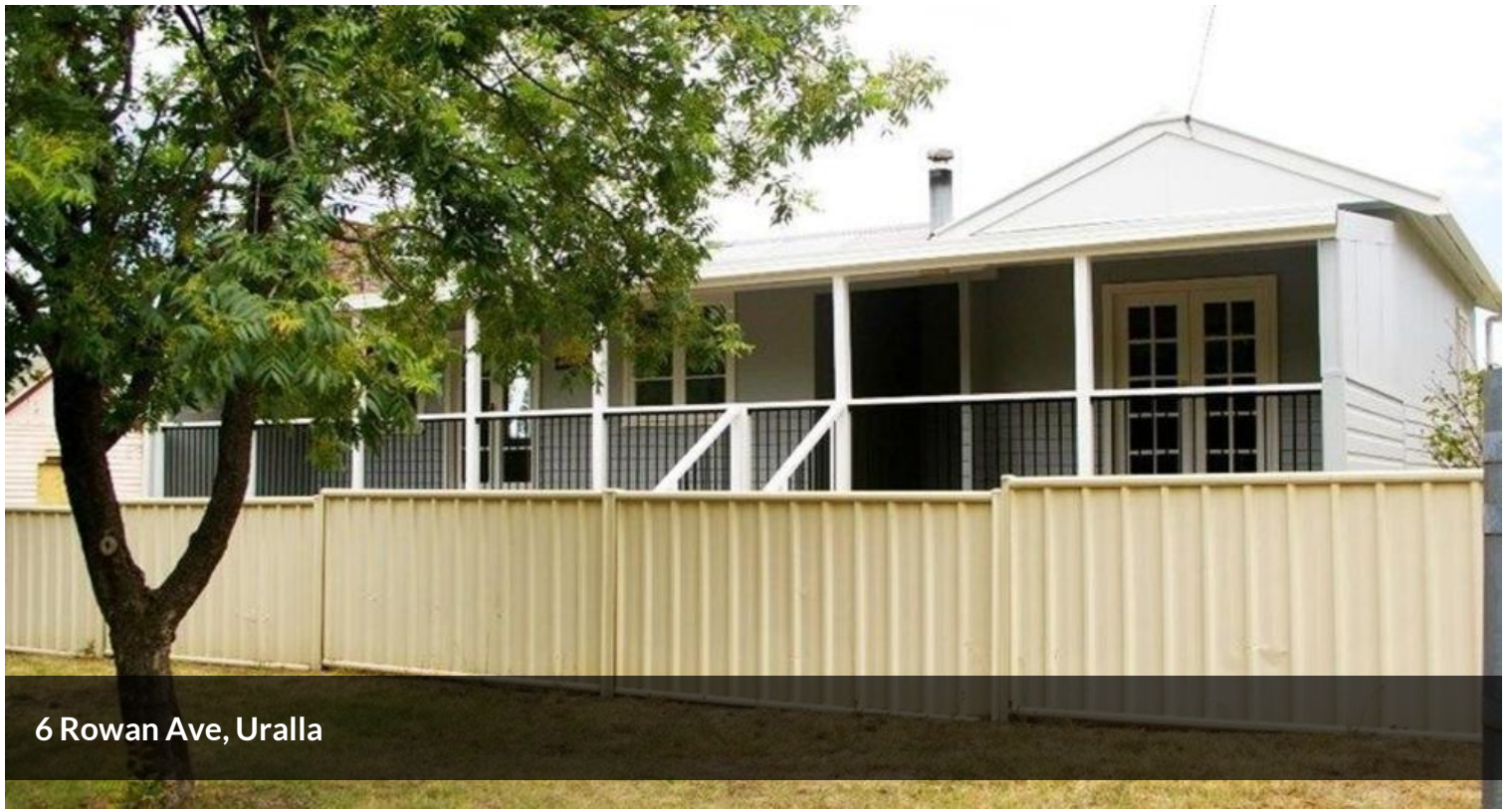
6 Rowan Ave, Uralla